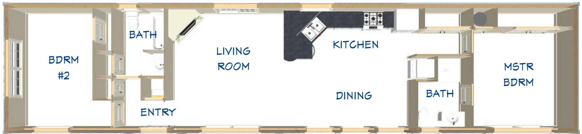
FLOOR PLAN OVERVIEW